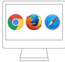
PC and Mac Chrome | Firefox | Safari